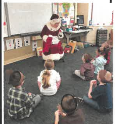
Mrs. Claus visited Millside and handed out honorary Rudolph noses, exciting!