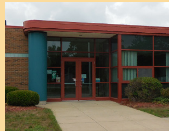
Millside ES (needs secure entry)