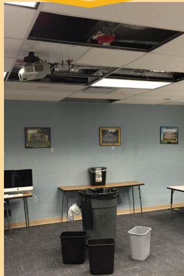
Algonac Jr./Sr. HS (roof leaks)