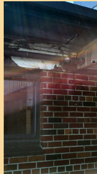
PTECC (exterior deterioration)