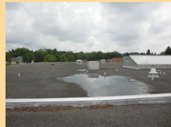
Algonquin ES (ponding on roof)